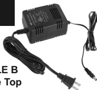
STYLE B Table Top